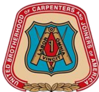
Carpenters' District Council of Ontario (CDC)