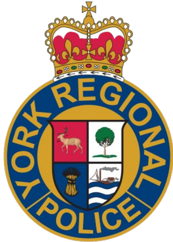
York Regional Police